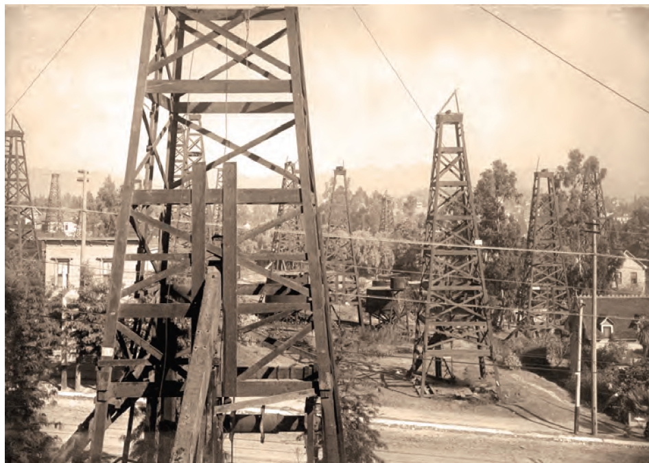
Oil derricks and houses in central Los Angeles, 1905.

Development of the oil fields during the twentieth century went hand in hand with rapid population growth and extensive urbanization of the Los Angeles Basin. Competing land use practices and evolving community priorities have constrained petroleum development throughout the history of the basin. In spite of abundant in-place resources and famously high local demand for refined petroleum products, recovery efficiency remains low and basinwide production continues to fall. Many small to medium-size oil fields have already been shut-in or abandoned, and recovery of oil